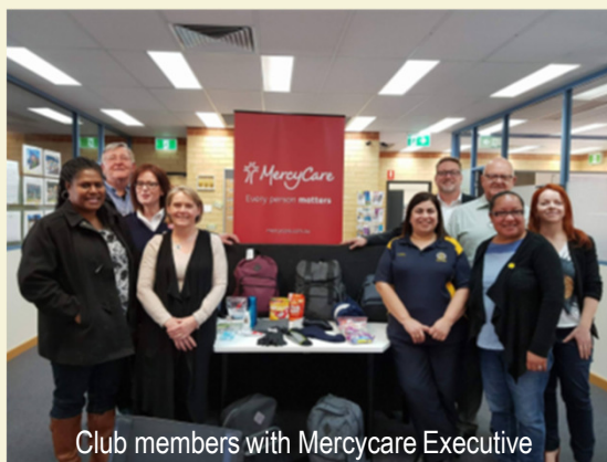
Club members with Mercycare Executive

As part of its ongoing "Make A Difference" effort in the local community and for Homelessness Week, the Rotary Club of Mindarie donated 30 winter backpacks to MercyCare, for distribution from the Merriwa Community Hub, to persons presenting with homelessness and requiring immediate help.