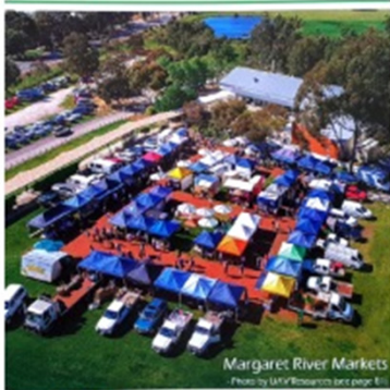
Margaret River Markets and page 60 HOME Community & Business Information for the Margaret River region

Every year the Rotary Club of Margaret River produces a printed community and business directory. Over the past 20 or more years the Rotary Directory has grown until now it is approximately 260 pages and is well-used in all households, offices and vehicles throughout the region.