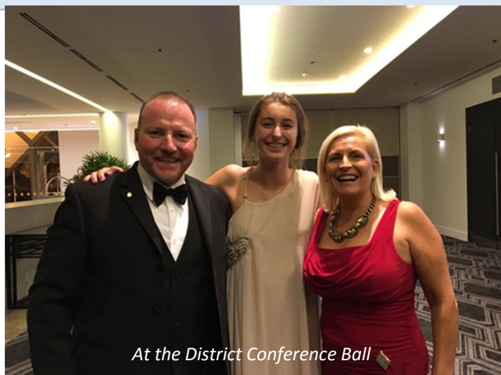
At the District Conference Ball

After the conducted tour of the renovations, the meeting closed at 1858pm