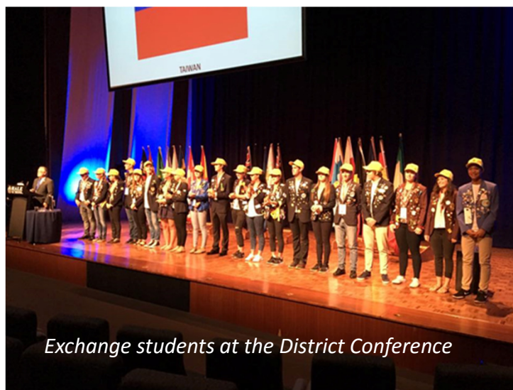
Exchange students at the District Conference